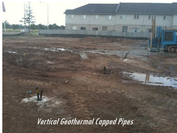
Vertical Geothermal Capped Pipes