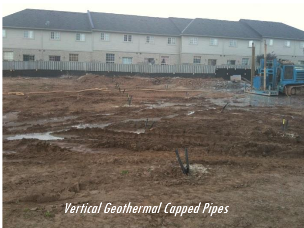
Vertical Geothermal Capped Pipes