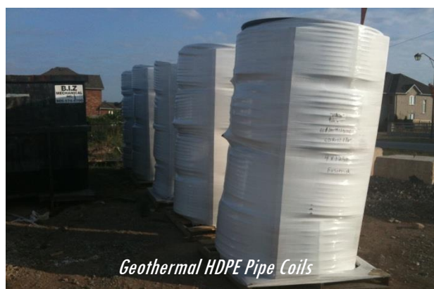
Geothermal HDPE Pipe Coils