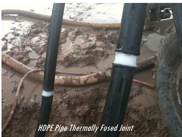
HDPE Pipe Thermally Fused Joint