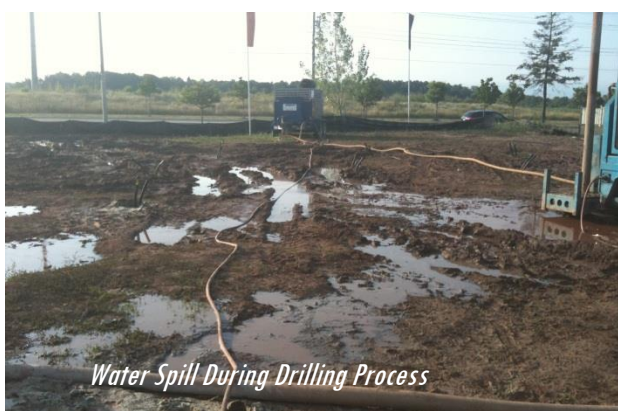
Water Spill During Drilling Process