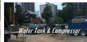
Water Tank & Compressor