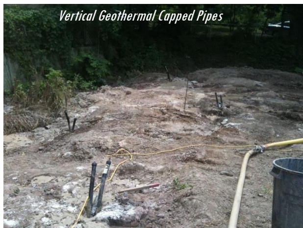
Vertical Geothermal Capped Pipes