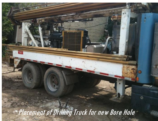
Placement of Drilling Truck for new Bore Hole