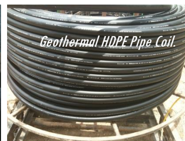
Geothermal HDPE Pipe Coil