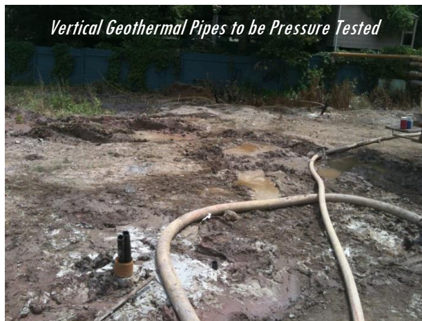
Vertical Geothermal Pipes to be Pressure Tested