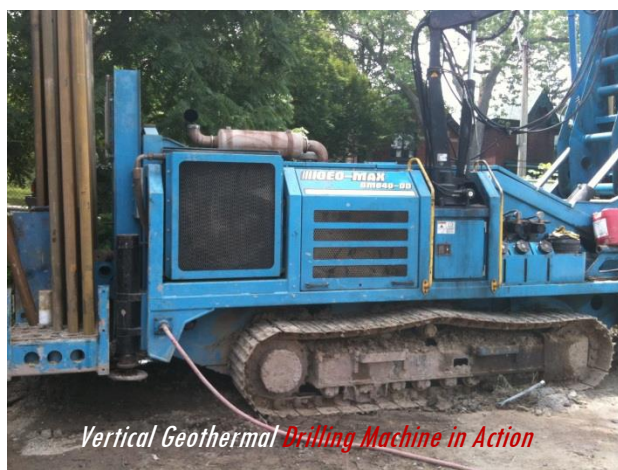
Vertical Geothermal Drilling Machine in Action