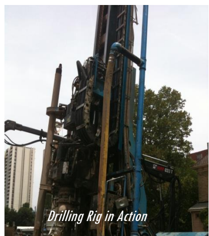
Drilling Rig in Action