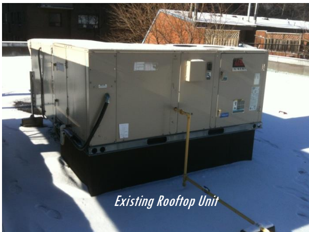
Existing Rooftop Unit