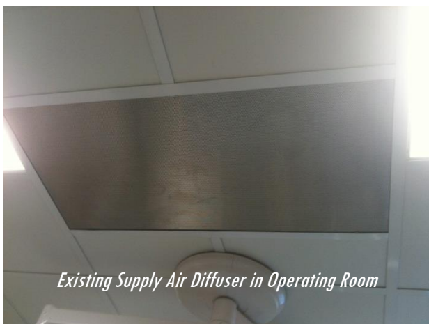
Existing Supply Air Diffuser in Operating Room