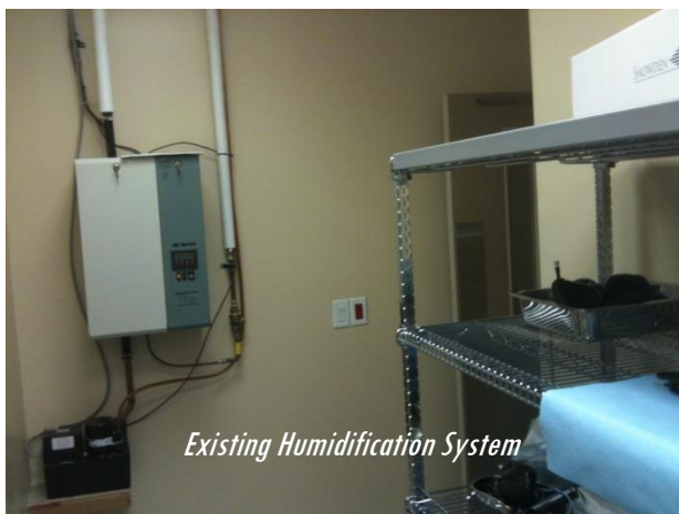
Existing Humidification System