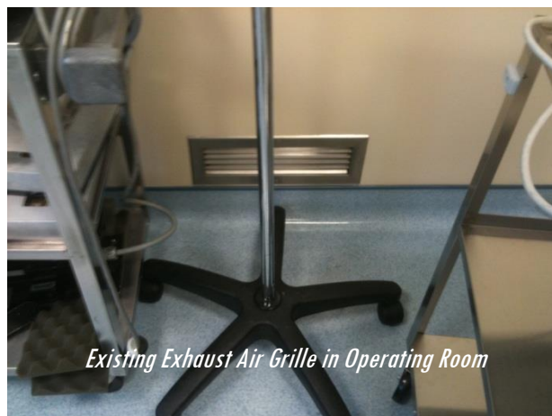
Existing Exhaust Air Grille in Operating Room